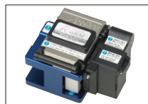
Table-top cleaver FC-6 / FC-6R series