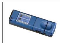
Hot jacket remover JR-6+