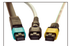
Available for Lynx-Custom Fit™ Splice-On Connector