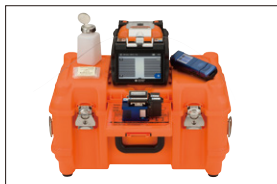
Carrying case with worktable CC-82