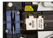
Pitch changing holder PCH-12