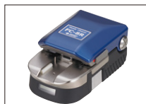
Handy cleaver FC-8R series